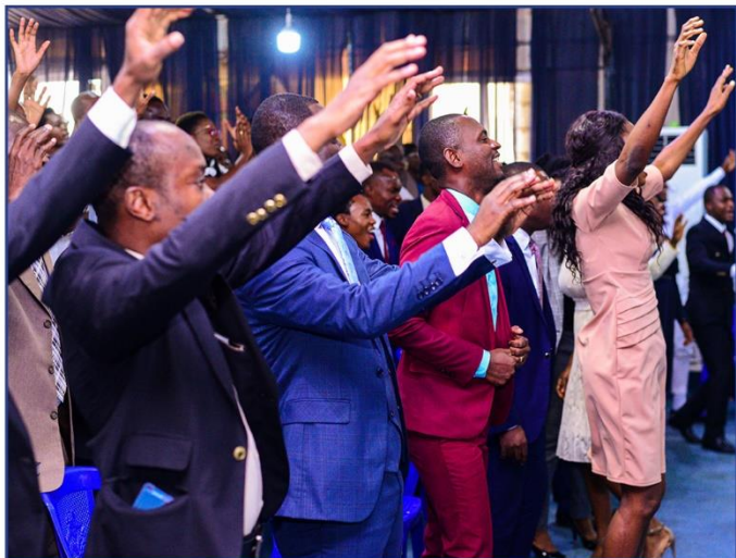
Final Global Movement: One Jesus, One Body of Christ, One Mandate

Every child of God was made for a purpose, and there's a ministry or shepherd God has chosen for him or her to fulfill that purpose (Jeremiah 3:15).